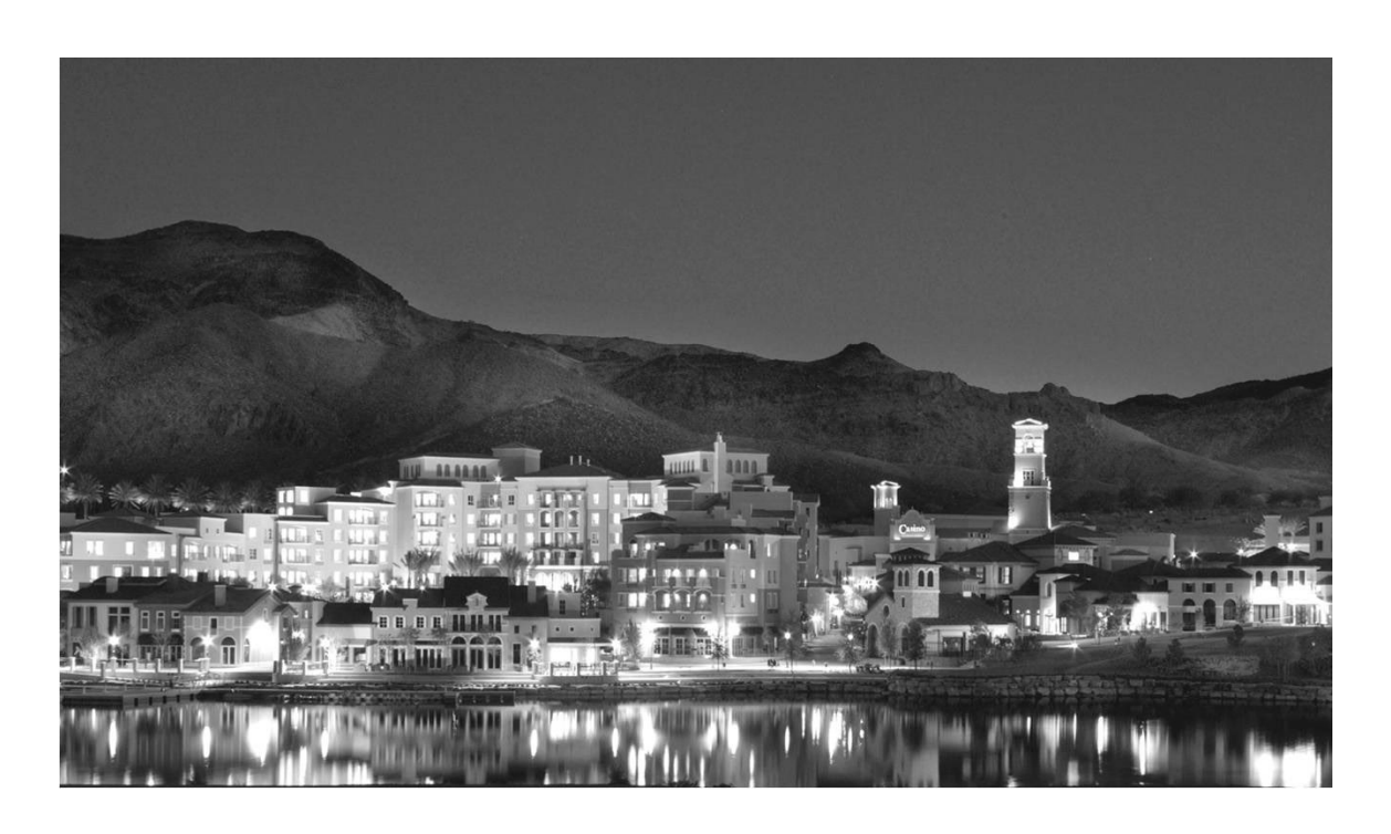
Lake Las Vegas, Nevada, USA – April 20-23, 2011